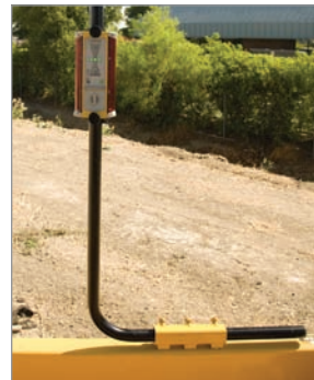
Universal L-Bar Mount